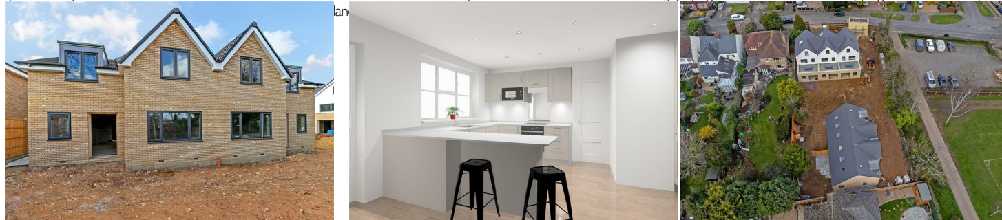
Ground Floor Approx. 693.2 sq. feet

Plot 4 is one of two semi-detached properties, which are currently under construction with a completion date for Summer 2022. This beautiful home has been designed with families in mind and will showcase simple lines as well as smart use of space to create a welcoming and comfortable haven. The floorplan measures approximately 1270.3 sq ft and is arranged over two floors. Accommodation briefly comprises of an entrance hall, living room, study, cloakroom, open kitchen/dining room and utility room on the ground floor. The first floor accommodates two double bedrooms, one with en-suite, a good sized third bedroom, and a family bathroom. The property will have private parking and a 10 year new home warranty. White Horse Lane is situated approximately 200 metres from the London Colney High Street which offers a range of services and facilities and is well connected by public transport, as well as excellent access to the M25, A414 & A1081. The development is also next to the Morris Way playing fields and near to the shopping facilities at Colney